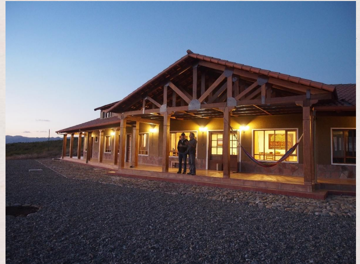
RUMI KIPU ECOHOTEL