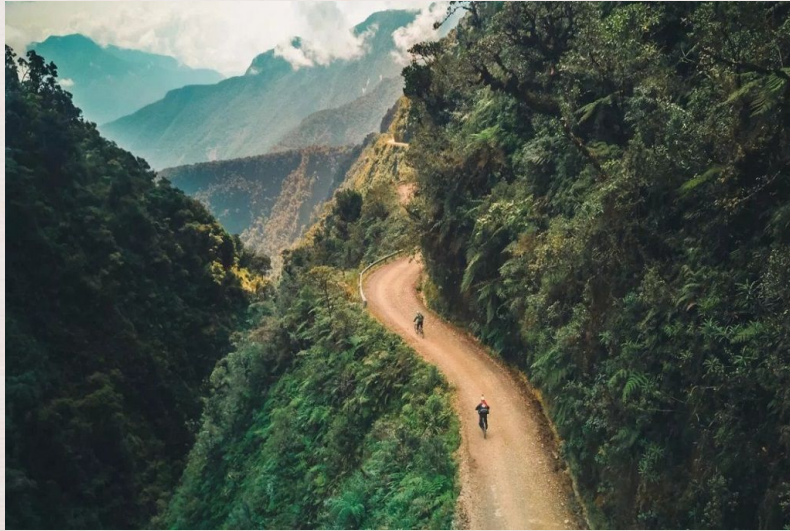
CAMINO DEL DIABLO