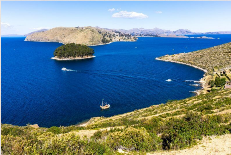
ISLA DEL SOL