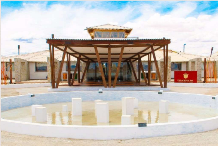
HOTEL PALACIO DE SAL