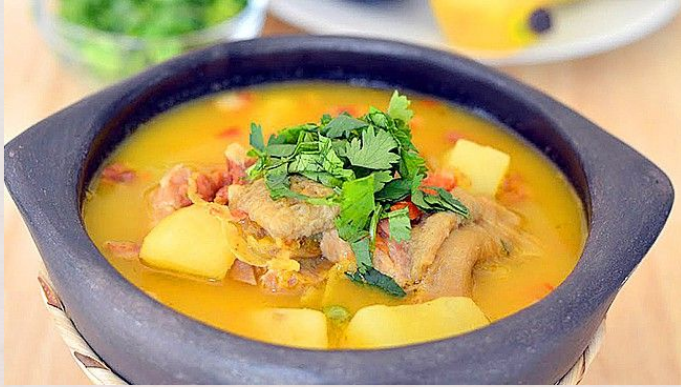
Sopa de mondongo