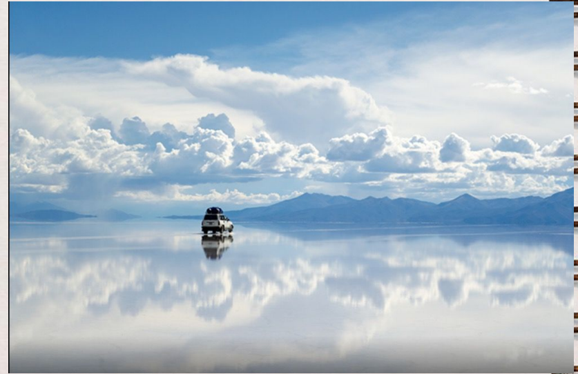
SALAR DE UYUNI