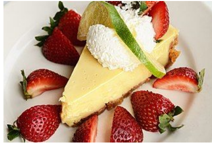
Key lime pie