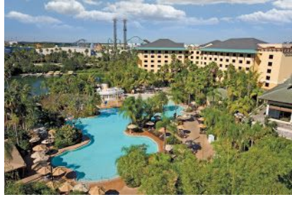
Loews Royal Pacific Resort