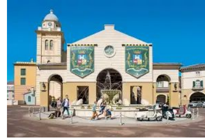
Loews Portofino Bay Hotel at