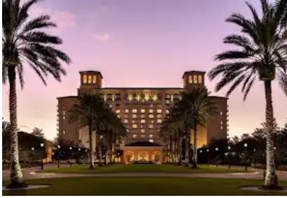
The Ritz-Carlton Orlando