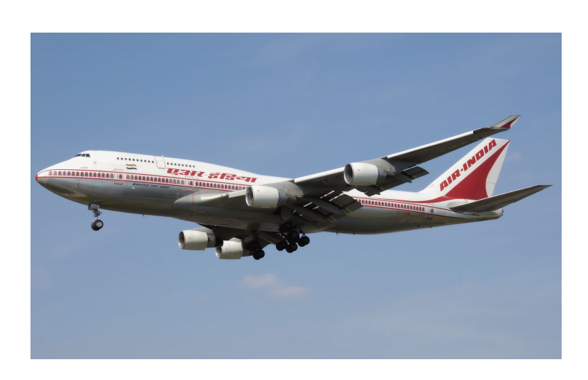
a one-way ticket costs approx. 890 euros