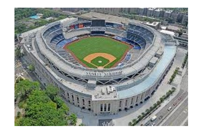
Yankee Stadium (Bronx)