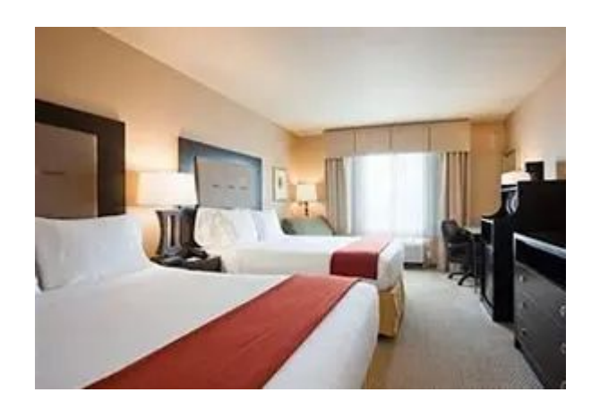
Holiday Inn Express Manhattan Times Square South. (Manhattan) 3 79 euros