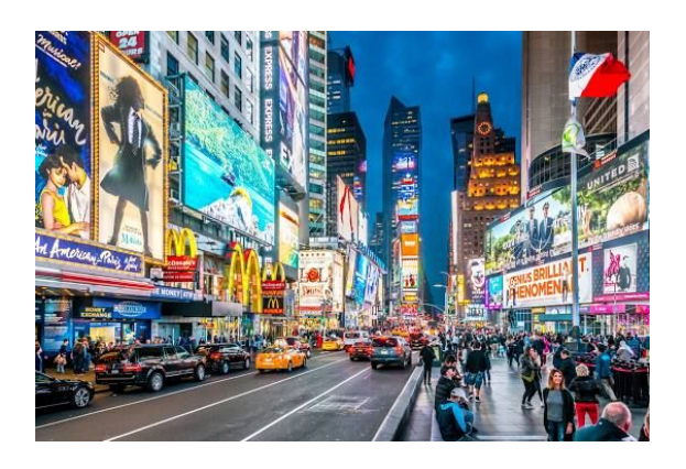
Times Square (Manhattan)