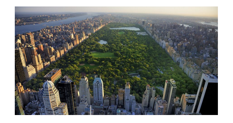
Central Park (Manhattan)