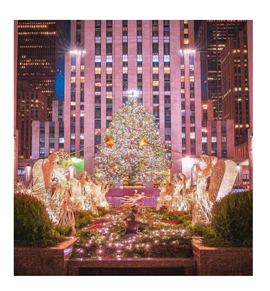
Rockefeller Center Christmas Tree (Manhattan)