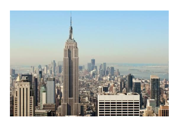
Empire State Building (Manhattan)