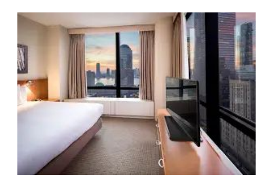
Millenium Hilton. 4 ** (Financial District) 84 euros