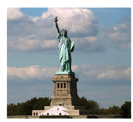
Statue of Liberty (Manhattan)