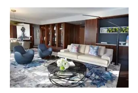
The Langham, New York, Fifth Avenue 5 $\dag{\pmathcase}$ 447 euros