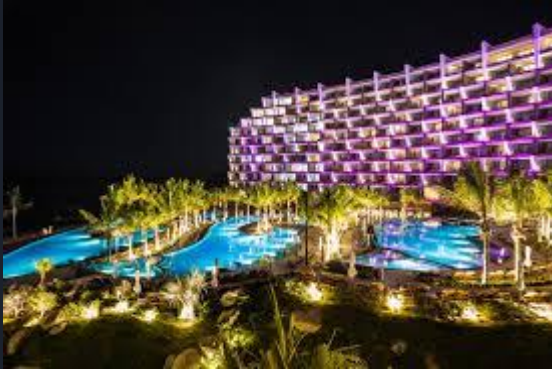
Hotel Gran Vela los Cabos 5 stars