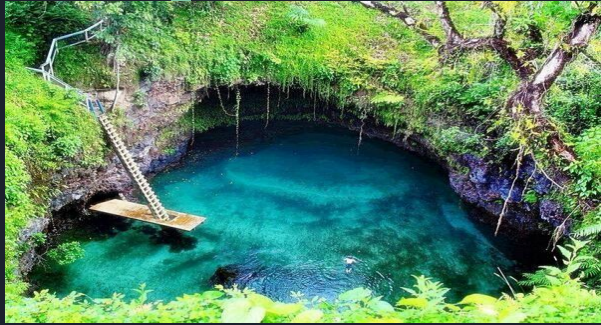
TO SUA OCEAN