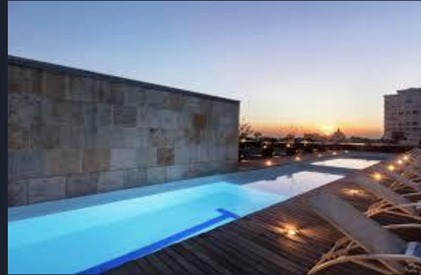
Hotel Hilton Mexico city reforma