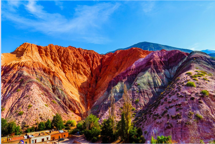
The hill of the seven colors