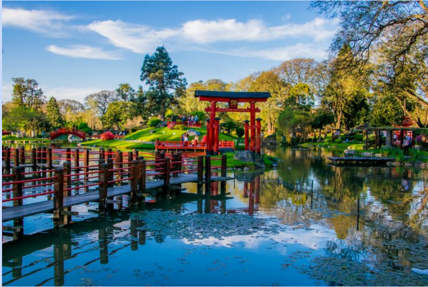
The Japanese Garden.