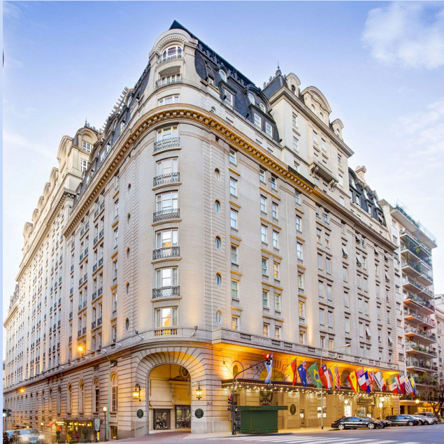
Grand Plaza Hotel: 880 € ★★★★★