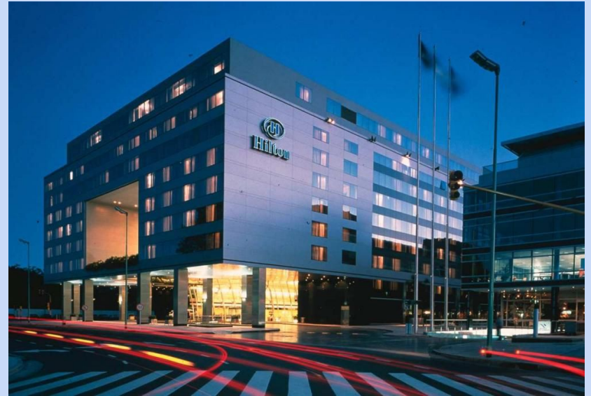
Hilton Hotel: 550€ ★★★★★