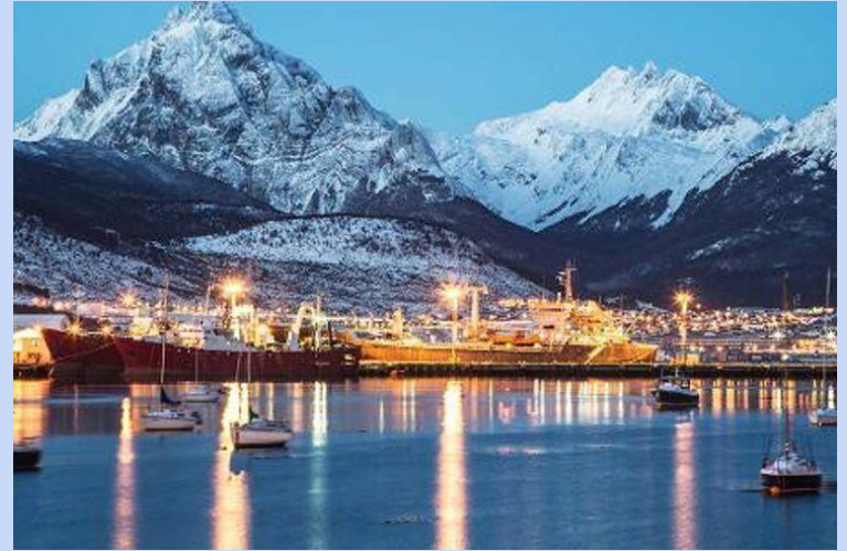
Ushuaia, The end of the world