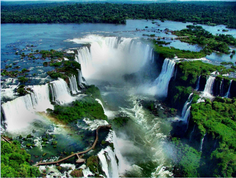
The Iguazu falls.