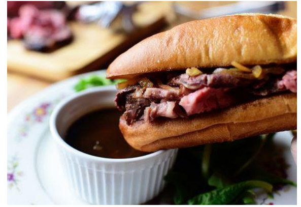
French dip sandwich