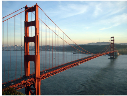
Golden Gate Bridge