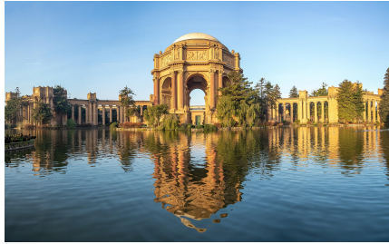
Palace of Fine Arts