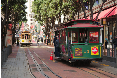
San Francisco cable car system