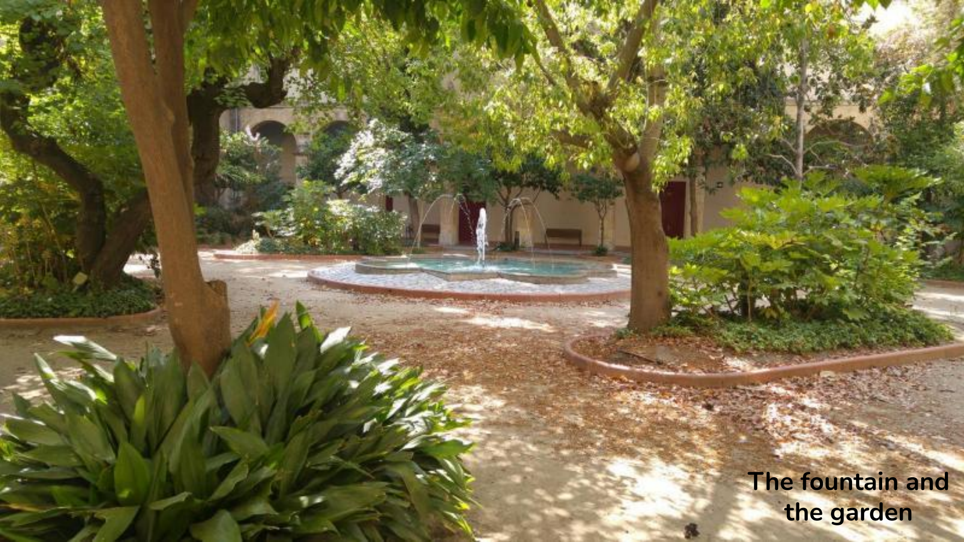
The fountain and the garden