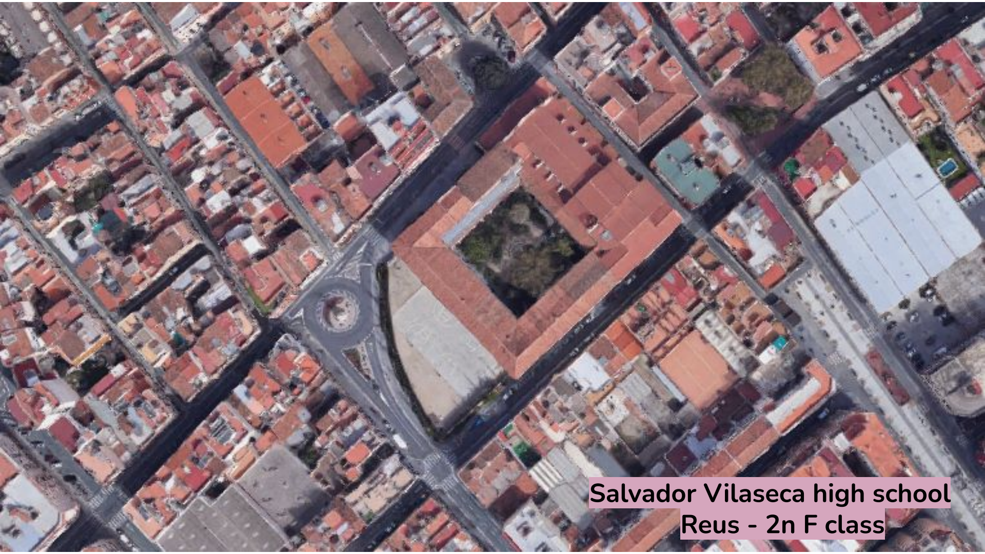
Salvador Vilaseca high school Reus - 2n F class