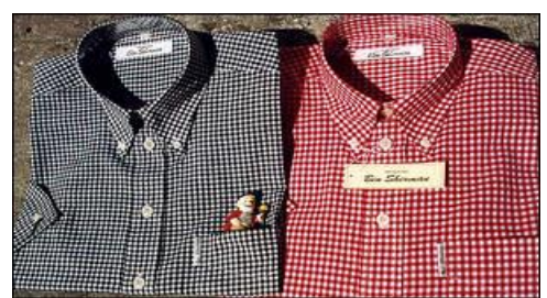
Wear with care: The man lost his designer shirt - and his jeans

The hunt is on for a knife-wielding thief who forced his victim to strip before making off with the man's designer clothes.