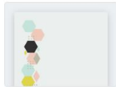
GROUP 4 S'ha editat fa uns minuts