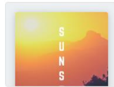
GROUP 3 S'ha editat fa uns minuts