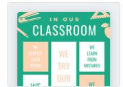
GROUP 1 S'ha editat fa uns minuts

You can choose the background, colour, design... you prefer (together with your partners).