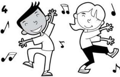
ride a bike / dance