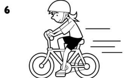
run / ride a bike