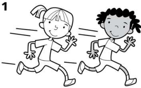
jump / run