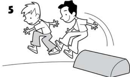
jump / rollerblade