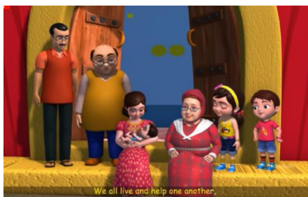
Our Family – Nursery Rhymes for children Infobells

Let's review the family members together: (Click on the image)