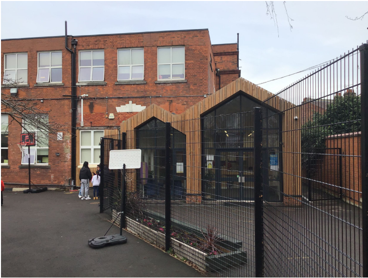
This is our school entrance