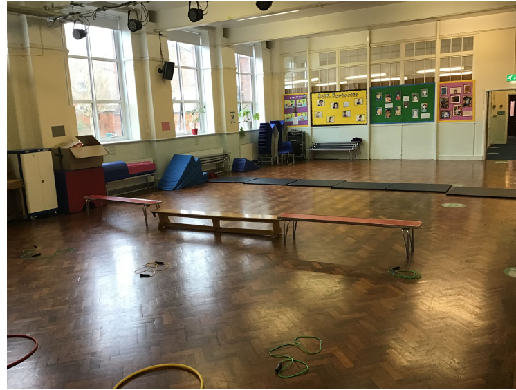
This is our assembly hall