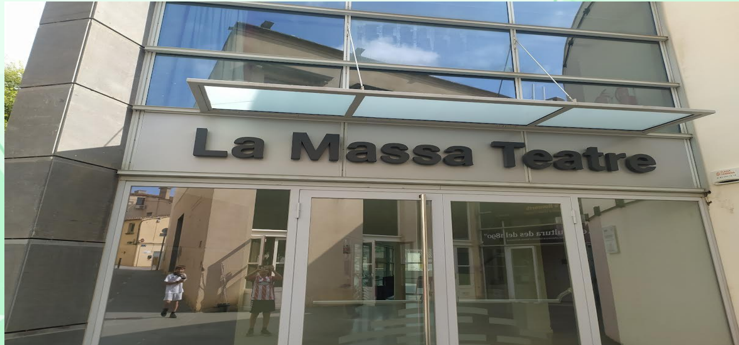
La Massa theater

We have a theater where we can watch lots of plays.