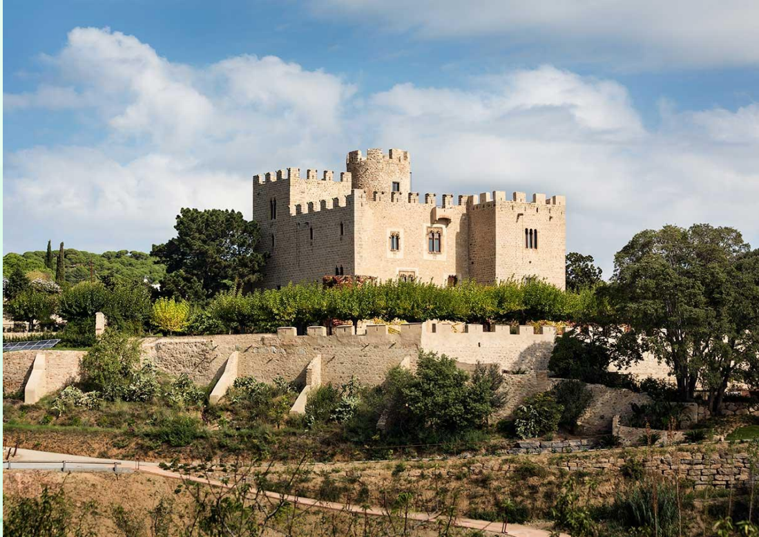
Vilassar de Dalt castle