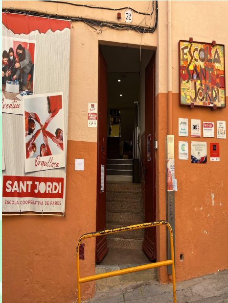
Sant Jordi School