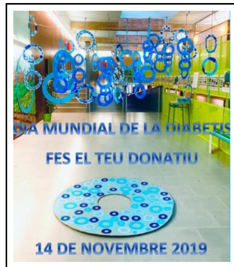
World Diabetes Day Decoration at school entrance