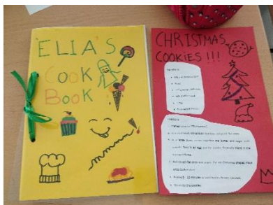
El Castellot Cook Books