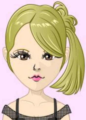
31 F O T I N I