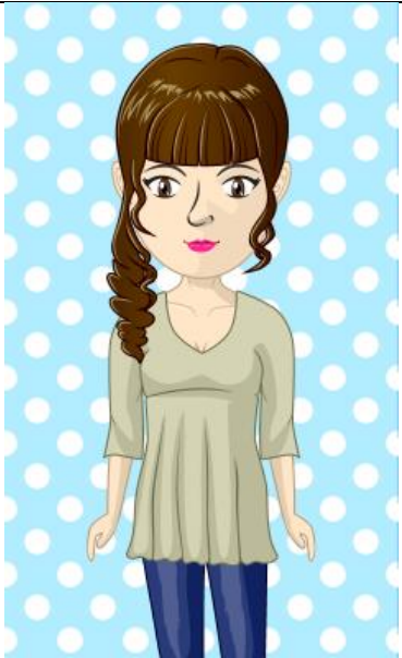
5 F I L O T H E Y