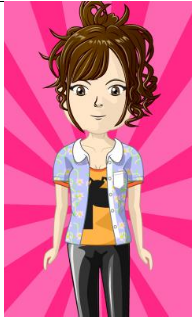
7 D E P Y