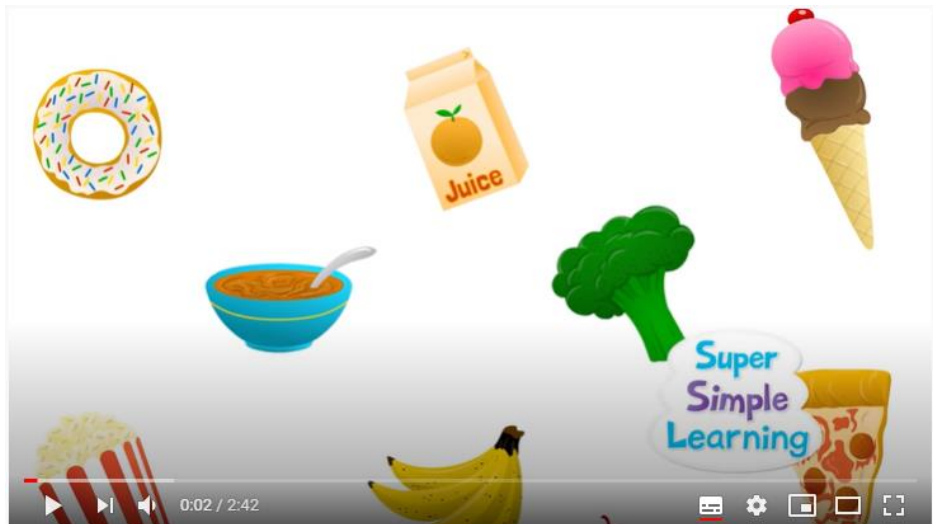
SUPER SIMPLE SONGS - VIDEO COLLECTION, VOLUME 2 T1 · E4 Do You Like Broccoli Ice Cream? | Super Simple Songs

https://www.youtube.com/watch?v=frN3nvIHUK