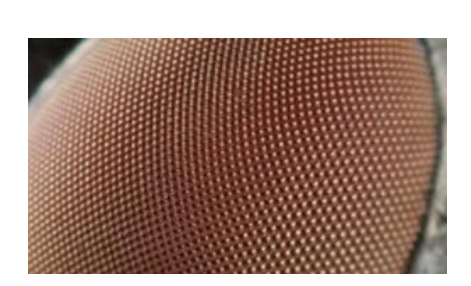
The EYE of a fly